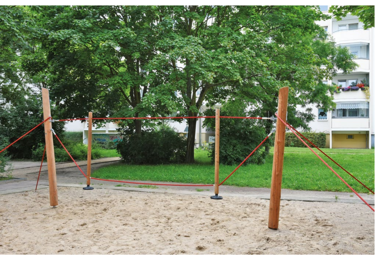
The photo shows different Tensioning ropes

This engaging yet simple construction offers little acrobats manifold opportunities for play: Swinging and swaying, balancing, hanging or a forward rolls. Physical skill, courage and creativity can develop here or it is possible to simply sit suspended on the pendulum seats. The Small Acrobat Rig is as suited to individuals as larger play groups.