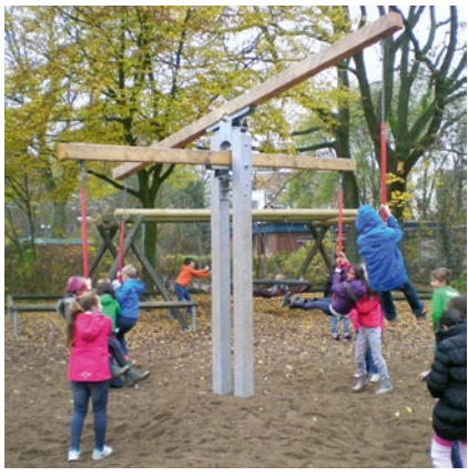
Order No. 6.10101 with stainless steel support frame