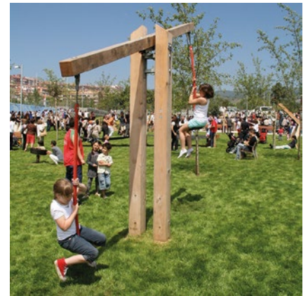
Version made of square timber

Our Scales are similar to a raised see-saw with hanging pendulum seats. The swinging up-and-down movements can be either gentle or more forceful depending on how the children push off from the ground. Being able to make the pendulum seats move sideways, in circles as well as together with several other children on one seat makes it even more fun.