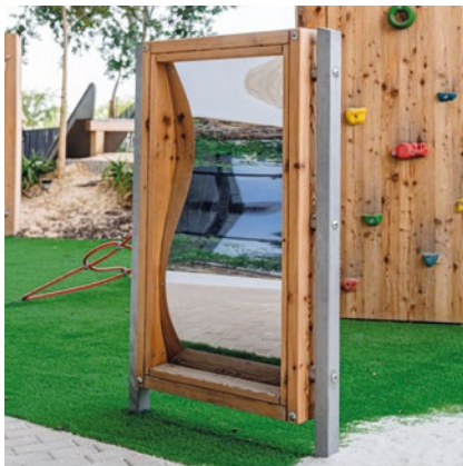
Order No. 9.10702 Distorting Mirror