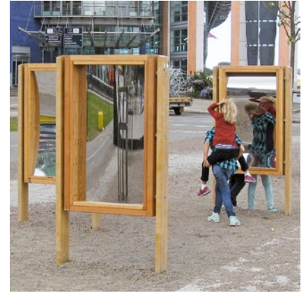
Order No. 9.10600 Distorting Mirror