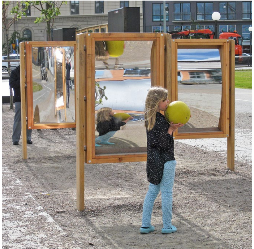
Order No. 9.10600 Distorting Mirror