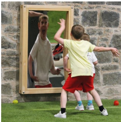
Order No. 9.10500 Distorting Mirror for wall attachment