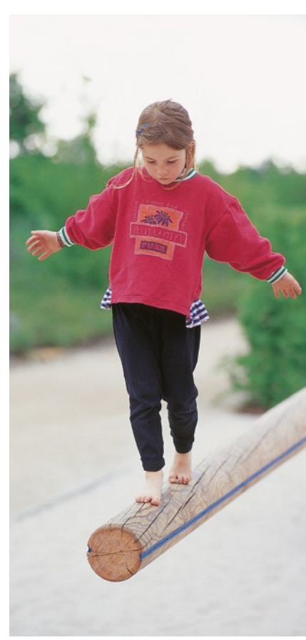
Standard colour is red.

Spatial limitation, sitting possibility, equipment for games of skills and for experiencing movements. All this is given by the "Lounging Logs" installation. This equipment is suited to define play areas and to separate play equipment for different age groups in a positive way. In particular, alternative places to sit, are offered to young people. If someone wants to stand out, they can balance along the beams projecting on both sides. Restlessness and strain can be reduced while slightly rocking up and down on the beams. Furthermore, communication is encouraged, when several children are swinging up and down together.