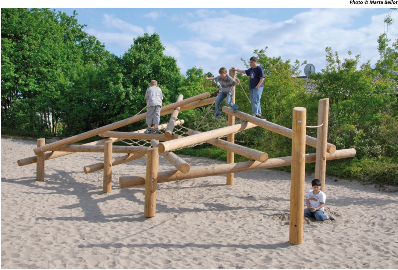
Climbing Structure 08