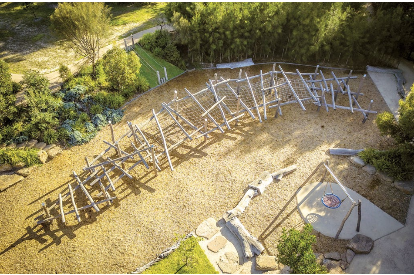
Special version with rings and caps, Photo © Tristan Filippone