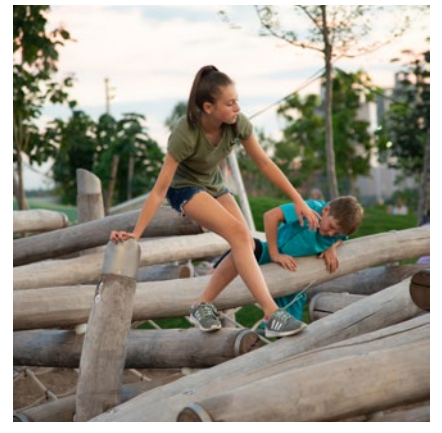
Special version with rings and caps, Photo © Daniel Perales

Climbing Structures made from handprocessed irregular round logs, can be integrated into a strongly natureoriented environment due to their formal expressive character. Many children can play within a small space; Climbing Structures can even absorb the arrival of a large number of children who wish to play on it and incorporate all of them within a flowing play rhythm. Climbing Structures do not only allow for climbing, experiencing height, and for having a sensual experience with hands and feet, but they can also be used as a nice seat for relaxing and observing.