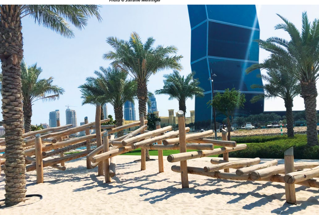
Special version with rings and caps