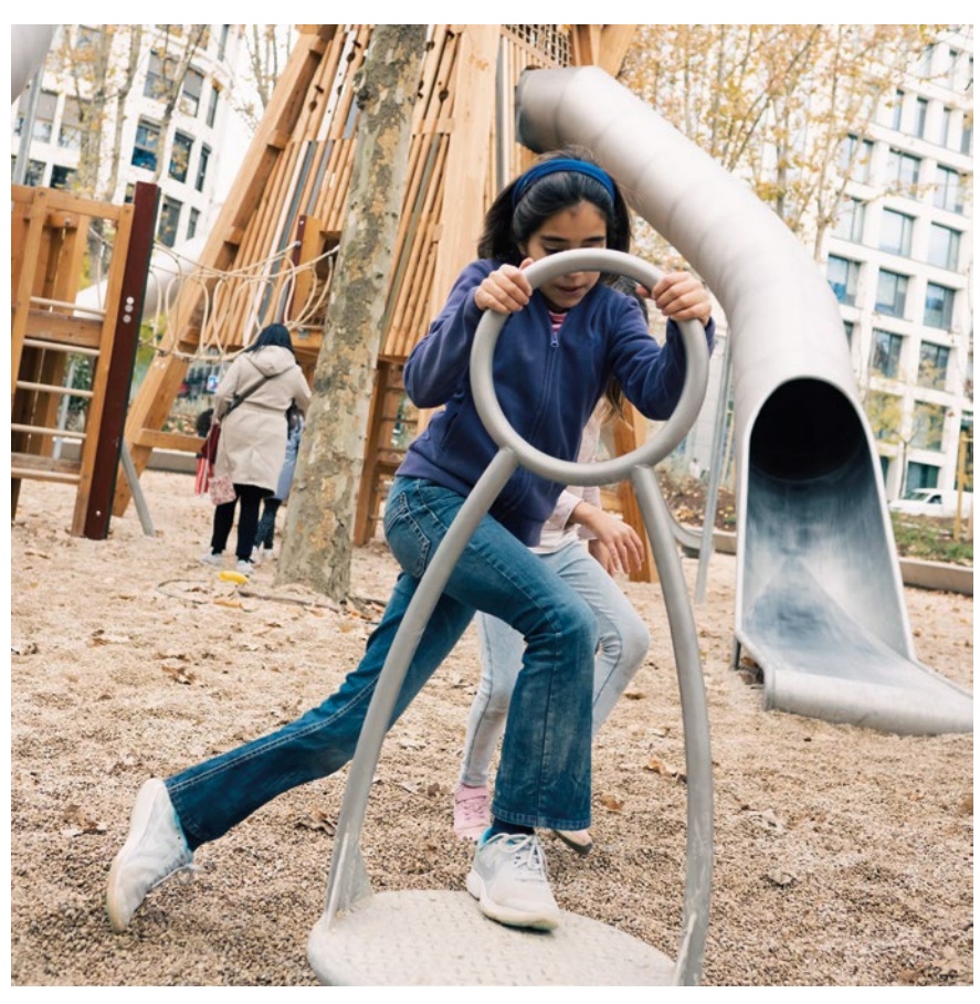
Medium Spinner Large Spinner