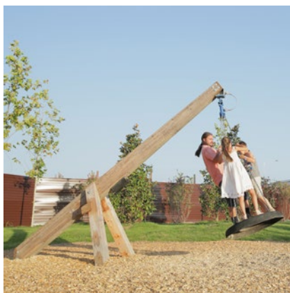
Car Tyre Swing