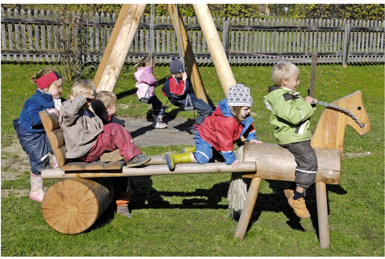
Order No. 4.24140 "Peter" Horse-cart