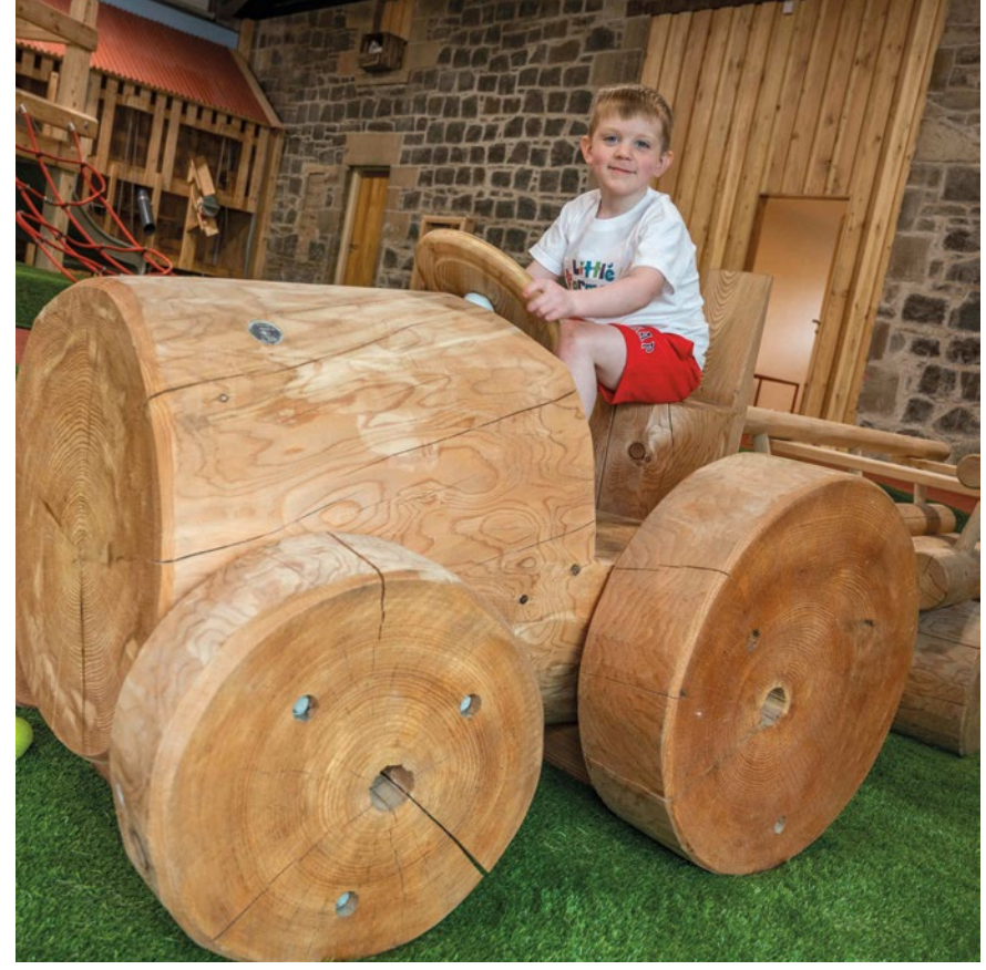
Order No. 4.24000 Tractor with Order No. 4.24010 Trailer for Tractor