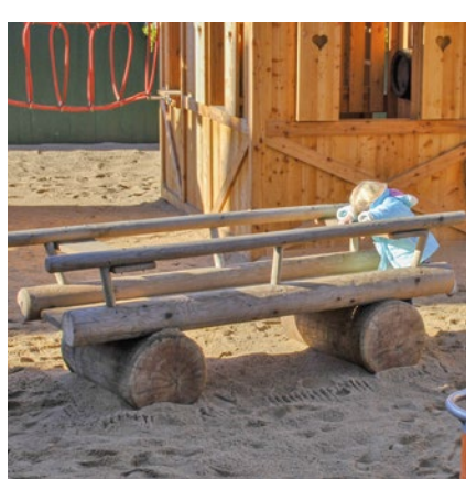
Order No. 4.24010 Trailer for Tractor