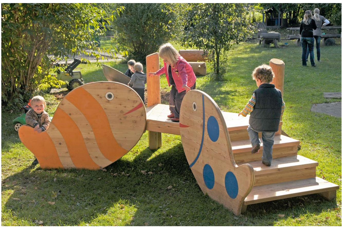
Technical change at the posts