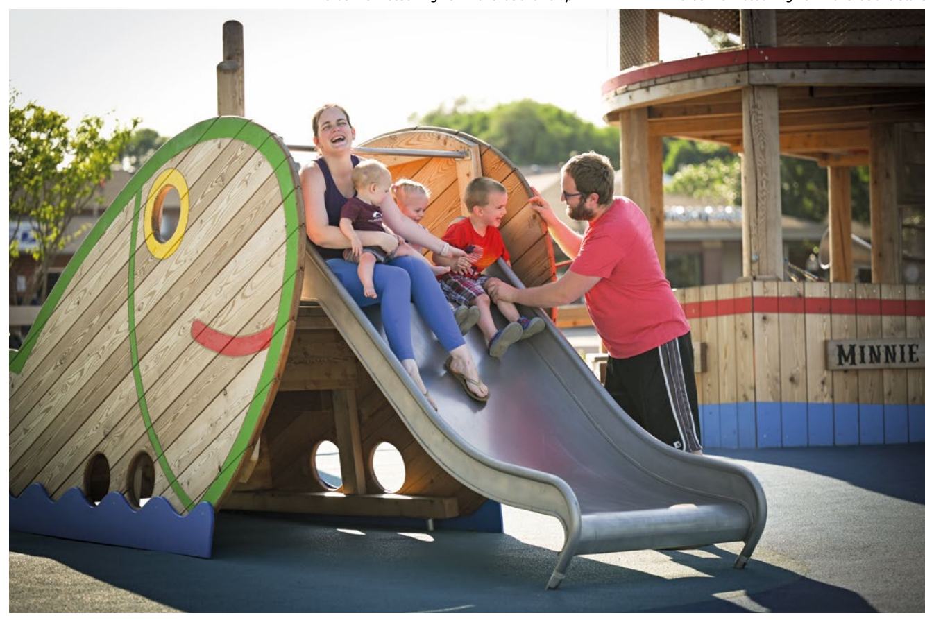
Order No. 4.08301 Big Fish with Slide and Stairs. The photos show a deviating wave.