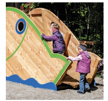
Order No. 4.08304 Big Fish with Slide and Ramp

The attractive appearance of the Big Fish, which is just rising out of the water, gives this play equipment its stimulative nature. The children can conquer the platform via a wide ramp or stairs and can explore their surroundings through big "portholes". They can also enjoy sliding fun together on the wide slide. The tummy of the fish under the platform can also be used as a hidey-hole or a little house.