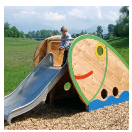
Order No. 4.08301 Big Fish with Slide and Stairs