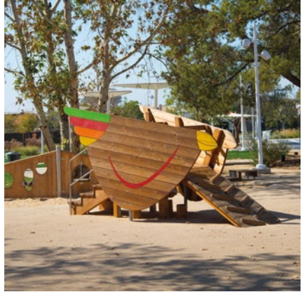
Special version with ramp and stairs

The likeable appeal of the chicken plays a role in creating a play environment which is favourable for children. The coloured design immediately attracts children to play. The net in the stomach is a small meeting place where children can come to find seclusion.