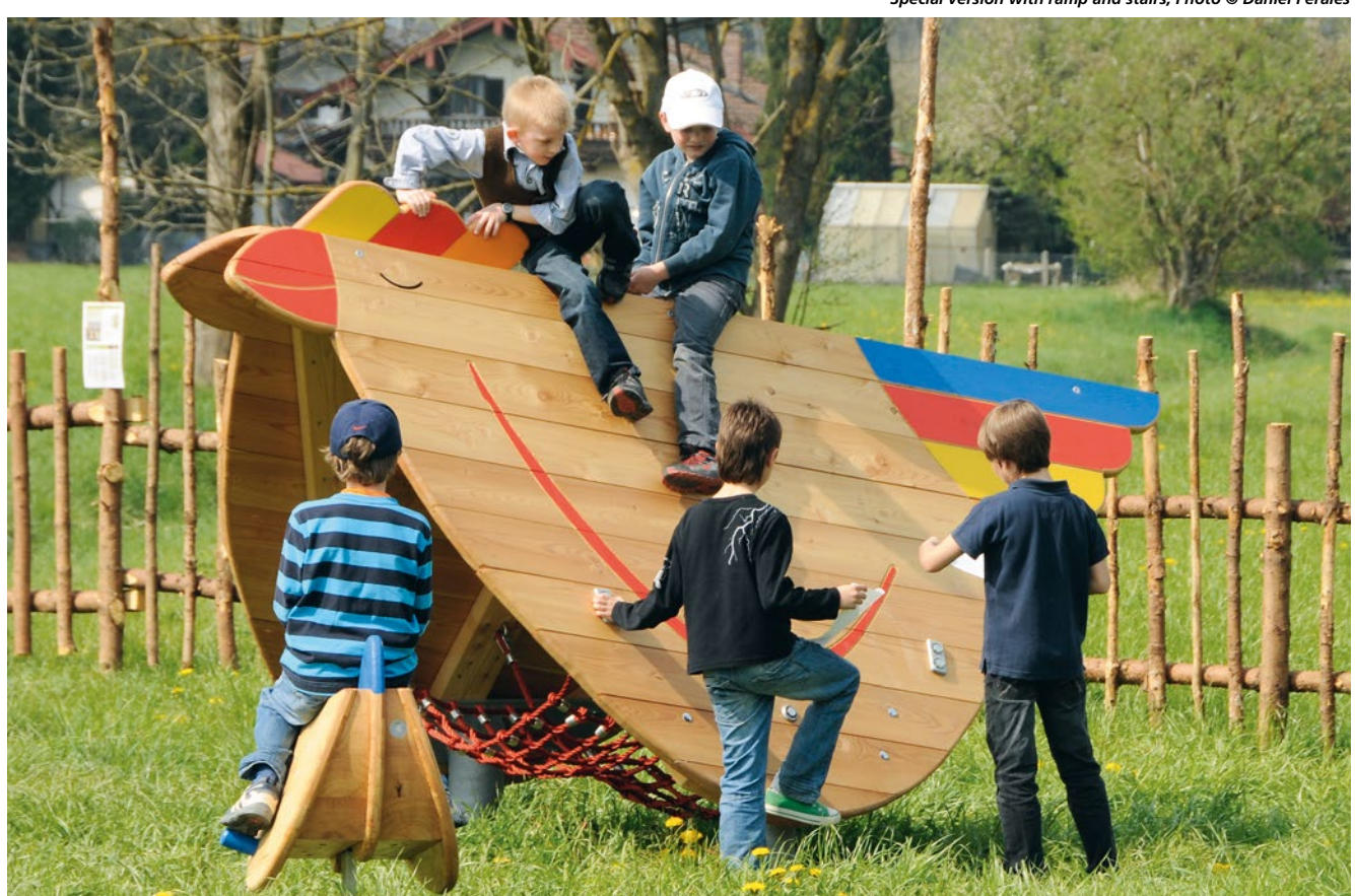
Big Chicken with Net