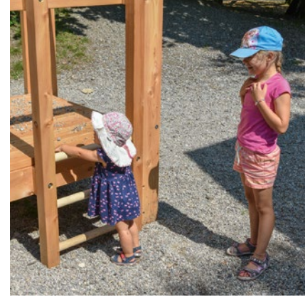
Order No. 3.14200 Toddler's Platform Hut