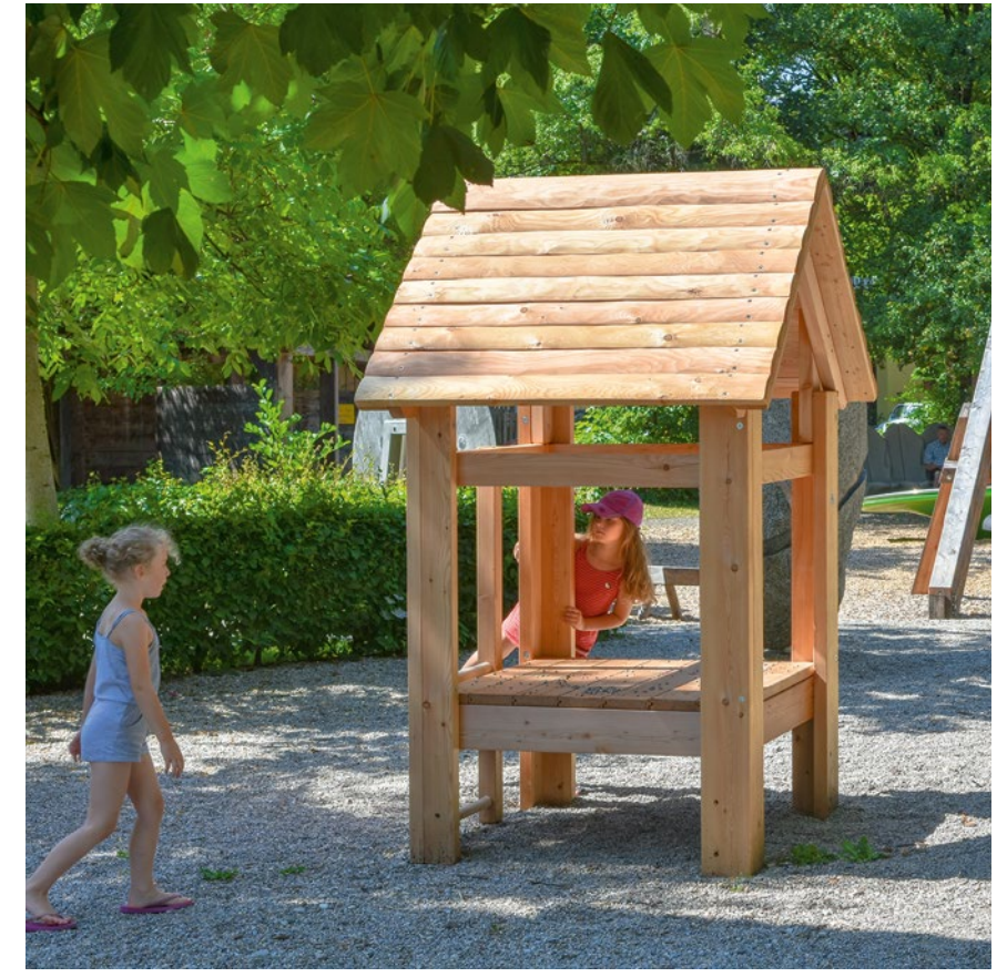
Order No. 3.14230 Toddler's Platform Hut with roof