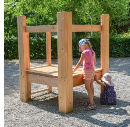
Order No. 3.14200 Toddler's Platform Hut

Toddler's Platform Hut Toddler's Platform Hut with roof