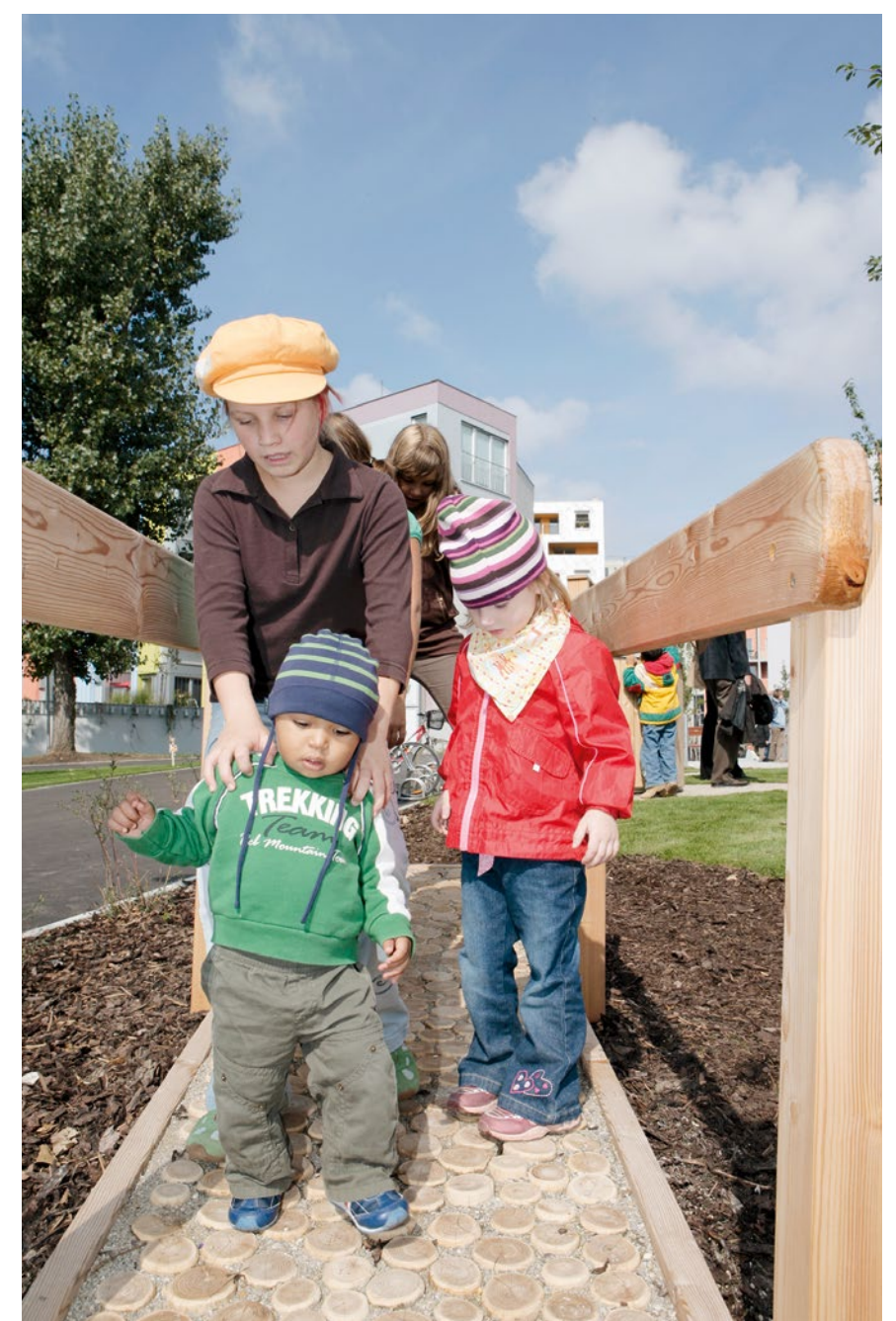
Order No. 11.50403 Wooden Path with log end pavers

The stations, based on real-life situations, invite you to try them out and exercise. Alongside agility, stamina is also trained in this circuit course. The path is set up so that not all the obstacles need to be overcome and so that an accompanying person can give best possible help. Handrails on both sides at every station additionally ensure the highest safety.