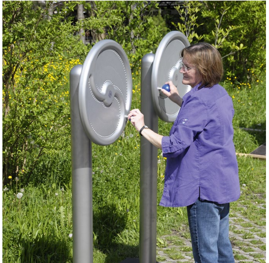
Small Sickle Disc

This equipment is especially custom-tailored to the requirements of older people. The main aim is to practice gripping motions and keep the joints mobile. For more information on this topic, please refer to our catalogue "Growing Older".