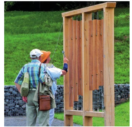
Order No. 10.53102 Tubular Dendrophone - double field