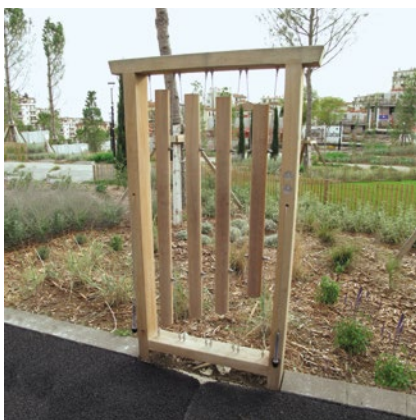
Order No. 10.53100 Tubular Dendrophone - single field